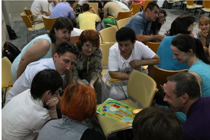
Activate Board Games at America House, Kyiv

No. Our goal is to get everyone playing on International Games Day, but November you can play on another date, for instance, if you have a class on Friday, November 20.