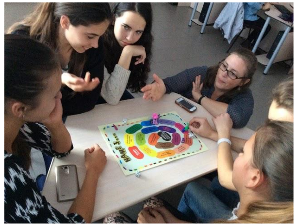
Activate Board Games in Cherkasy

All the games are available for free download from the American English website. Follow these links directly to each game: